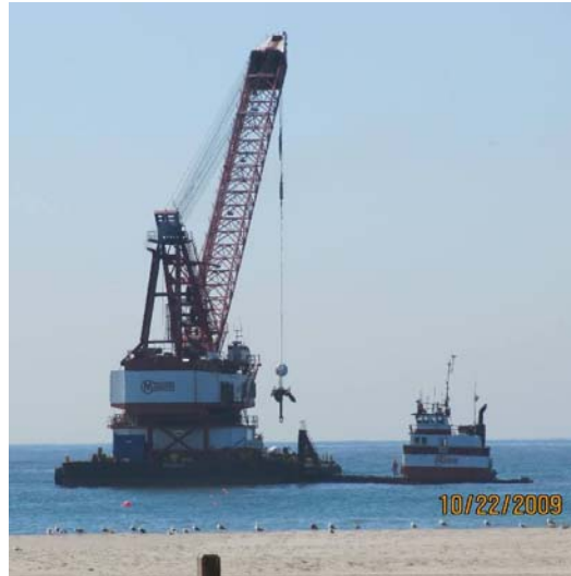
Figure 6. Derrick barge and supporting tugboat from shore

The first reaming pass was stopped after DP #60