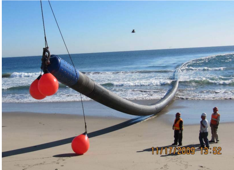
Figure 10. HDPE pipe heading out to sea from Pt. Mugu

Swabbing began on November 14 th from the entry point. Although slight delays were experienced pushing the 43-inch barrel reamer in and out of the 54-inch conductor casing, three swab passes were completed in two days. Mud was pumped at a moderate pressure throughout but little to no returns were observed at the entry point.