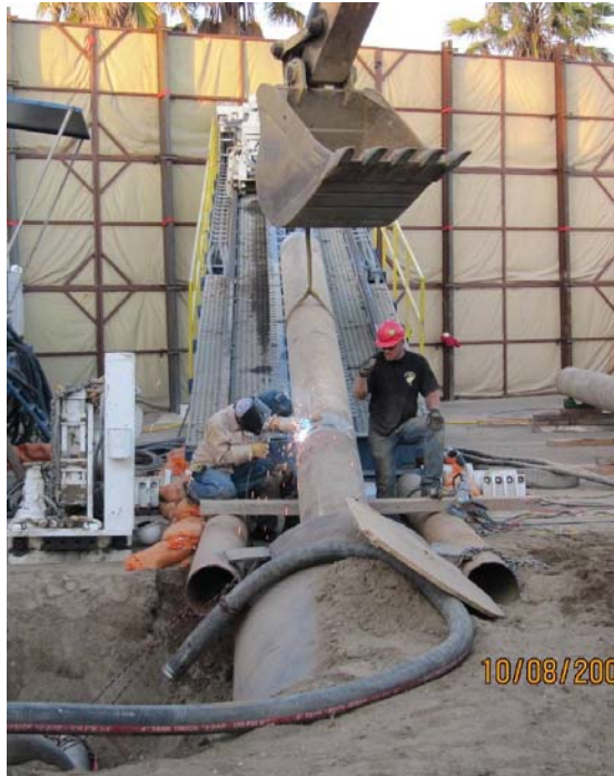
Figure 3. 18-inch centralizer casing installed in larger 54-inch casing

leaving the use of casing to the Contractor's discretion. However, the Contractor chose to utilize a casing due to his concern over gravel lenses present in the first 120 feet of the alignment. Additionally, review of the design suggested that use of conductor casing at the entry could help alleviate the large pressure differential resulting from the elevation difference of 56 feet between the entry and exit locations.