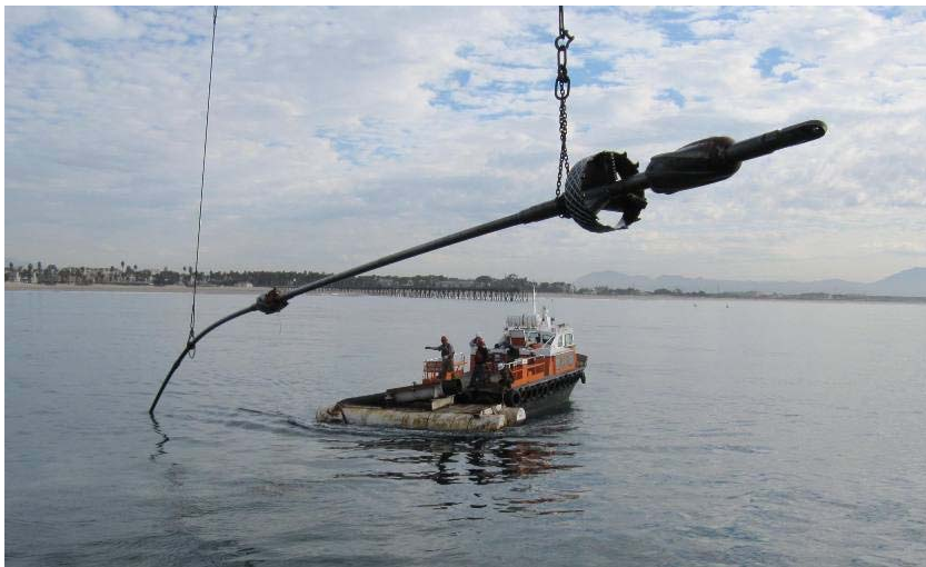
Figure 9. 48-inch reaming assembly exiting to the derrick barge

After removal of the 50-inch reamer, the Contractor advanced the drill pipe on to the deck of the derrick barge to serve as a tail string for a new 17-inch back reamer. The plan was to back ream the bore approximately 500 feet from the exit pit towards the shore, up until the 27-inch diameter hole generated by the first reaming pass. This pass was quickly and successfully performed and the 17-inch reamer tripped back to the derrick barge. The 50-inch reamer was reinstated back on the drill rig with modifications including four additional front jets and some new bullet bits to the barrel portion of the reamer in hopes of making a second attempt at forward reaming. This time the 50-inch reamer made it all the way to DP #49 before the rig maxed out its torque and was forced to trip back. The reaming pass experienced the same problems as the earlier attempt at the 50-inch diameter, with the addition of multiple breaks of the drill string between the pontoon and derrick barge.