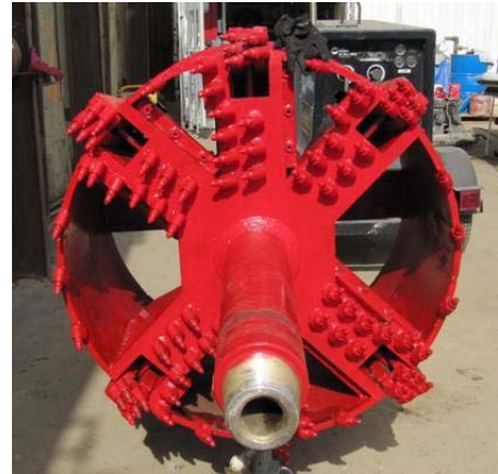
Figure 8. 45-inch reamer with expanding teeth

After 300 feet of drill string had been advanced, reaming was stopped to break a section of drill pipe off on the barge and reinstall the swivel and cable. Reaming continued smoothly until DP #15 when viscosity of the mud began to noticeably decrease and spoils coming off the mud tank separators turned from larger cohesive pieces to clays and ultrafine-grained material. Reaming continued, but the mud was not viscous enough to hold suspended spoils and had too much fine content to separate out at the tank. New mud was mixed and reaming continued slowly, with new mud being constantly made to keep the velocity up. Additionally, the derrick barge was having difficulties developing enough tension on the drill string and the rotary torque was slowly increasing. By DP #37 the rotary torque had increased beyond the capacity of the drill rig and the Contractor had decided to trip the reamer back to the entry point.