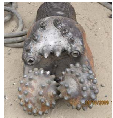
Figure 4. Tri-cone spud bit