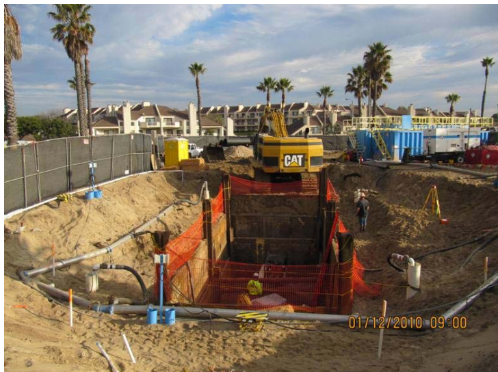
Figure 11. Excavation to expose pull head

However, once the pull head was exposed it was discovered that the pipe was too far out of alignment to be connected within the excavation at the end of the conductor casing. The last 90 feet of 36-inch diameter HDPE product pipe was eventually installed via open cut in February of 2010.