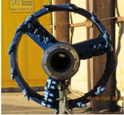
Figure 5. 27-inch fly cutter

(approximate STA 18+60) as the Contractor did not want to inadvertently ream the abandoned section of borehole which began at STA 20+50. After tripping back to the entry point, the original borehole assembly and drill bit was placed on the rig to re-drill the section of pilot bore out to the ocean floor and into the exit pit which had just been excavated via dredging. Drilling progressed without incident and a derrick barge was moved into position offshore to secure the borehole assembly upon the exit of the drill string (Figure 6). Sixty feet away from the exit the driller began pumping water to clear out the drill string of mud. Once clean, the driller pumped compressed air through the drill string in order to force air bubbles out the end which could be seen by the divers waiting on the barge.