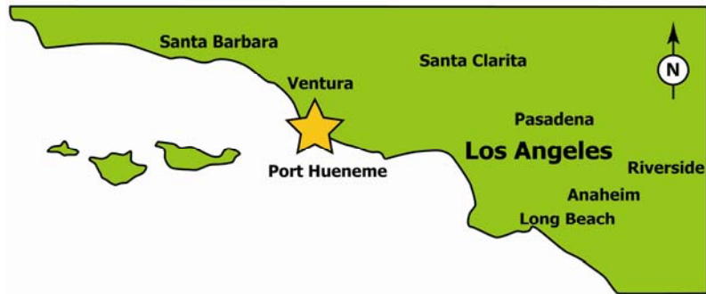
Figure 1. Location map of Port Hueneme, CA

The City of Port Hueneme is located in Ventura County on the southern coast of California (Figure 1). The project area is located on the coast,