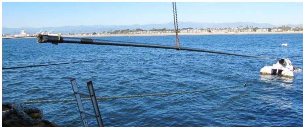
Figure 7. Drill string suspended between derrick barge and pontoon